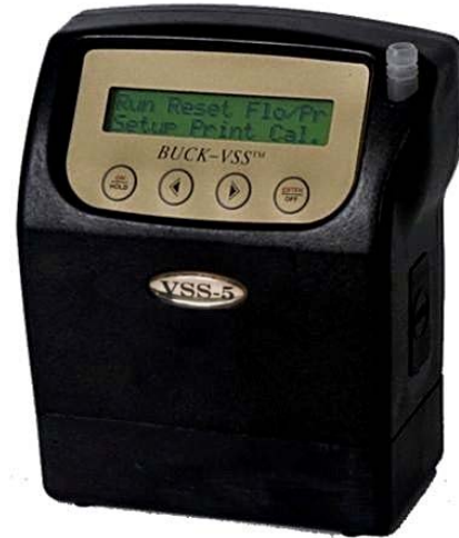
A Powerful Low Flow Data-Logging Sampling Pump for dedicated Low Flow (5 to 600 cc/min) applications

The BUCK VSS-5™ (Validated Sampling System) is the smallest, most powerful 5LPM data-logging pump for industrial hygiene, personal and area sampling, environmental sampling, and occupational health studies. Its advanced design, easy programmability, advanced operating software, and powerful sampling performance combine to give you everything you need in one pump. You can link a sample number, pump serial number, calibrator serial number, calibration data, and performance data to prove a valid sample. The one-hour recharging, interchangeable battery packs, built-in battery maintenance software, and easy switching from Constant Flow (cassettes) to Constant Pressure (sorbent tubes) without tools or accessories means you save time and money while ensuring an efficient, valid sample.