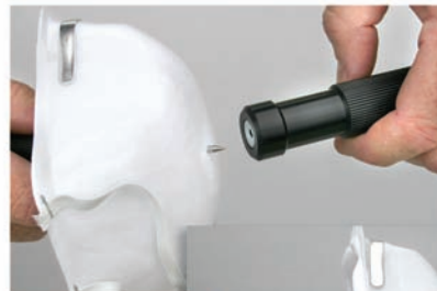
Step 4: On the outside of the respirator, align the push nut tool over the end of the exposed point. Hold the tools in-line with each other and firmly push them together as far as possible.