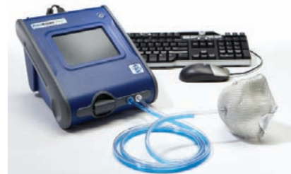
The PORTACOUNT PRO+ Respirator Fit Tester with probed P100 disposable respirator

The kit includes 500 lightweight disposable sampling probes and easy to use installation tools. It only takes a few seconds to puncture the mask, insert a probe and then press a push nut on from the other side. The PORTACOUNT PRO+ fit tester sample hose fits directly onto the exposed end of the sampling probe.