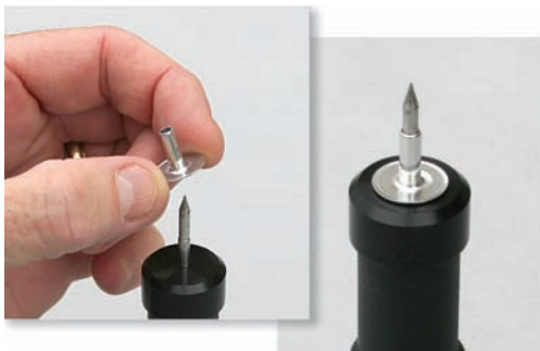
Step 1: Load a sample probe onto the piercing tool.