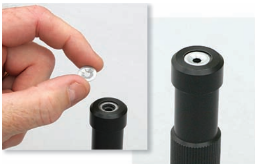
Step 2: Load a push nut onto the magnetic push nut tool.