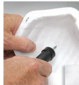
Step 3: Use the piercing tool to puncture the respirator from the inside. Push the point through far enough to be seen from the other side.