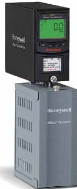
Midas Gas Detector with Midas Pyrolyzer