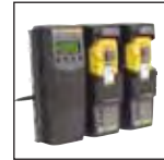
MicroDock II compatible