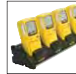
Multi-unit cradle charger