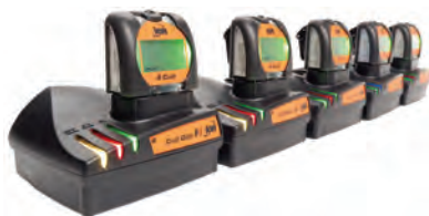
Cub's linked together within their docking stations.

When worker exposure exceeds pre-set limits the instrument's audible, vibrating and flashing LED alarms alert you to the gases present. Readings are displayed in ppb and ppm on its bright, back-lit LCD display with selectable data logging time.