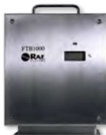
RAE PowerPak External Battery