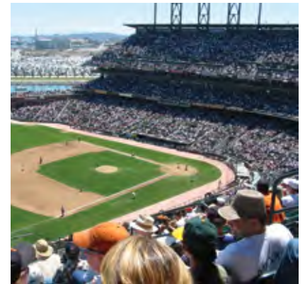
ProRAE Guardian is ideal for threat monitoring and detection of large-scale public venues