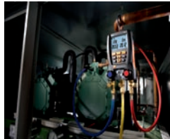
Conduct leak test