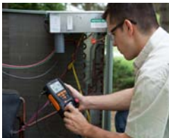
Troubleshoot, evacuate, charge