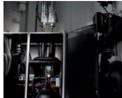
Cool, heat pump or auto mode