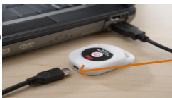
External port of NI-100