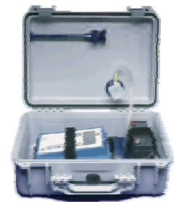
Environmental Enclosure Model 8520-1 with inlet assembly stored

Aspiration efficiency is defined as the fraction of particles that are sampled, compared to the total number of particles actually present in the air. An aspiration efficiency of 1.0 means that all particles are sampled. Aspiration efficiency is size dependent. The larger the particle, the more likely it is to escape sampling because momentum effects prevent it from following the flow streams. Smaller particles follow the flow stream more easily, and are sampled with higher efficiency.