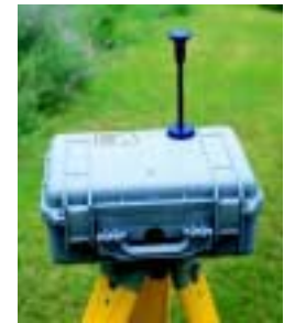
Environmental Enclosure in-use

Our knowledge of aerosol mechanics allows us to make predictions about the aspiration efficiencies of an inlet sampling in either calm or moving air. The mathematical models used to predict efficiency assume the use of a thin-walled cylindrical probe which is bent into the direction of the wind. To correctly apply these mathematical models to the TSI inlet, knowledge about why particle losses occur is necessary. Losses can be attributed to gravitational settling, particle impaction, and sub- or super-isokinetic effects.