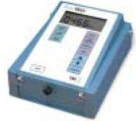
DustTrak Model 8520

The Model 8520-1 DustTrak Environmental Enclosure utilizes an external omnidirectional aerosol inlet to collect and direct particles into the TSI Model 8520 DustTrak Aerosol Monitor. The design of the inlet maximizes the aspiration efficiency of aerosol particles in wind conditions ranging from calm air to wind speeds of 22 mph.