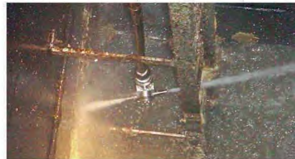
Above is a Gamajet in action. Rotating in a precise, controlled, 360-degree pattern, it blasts contaminants from the surface.

GobyJET: Portable pump system; an affordable alternative to Jetters or VacTrucks