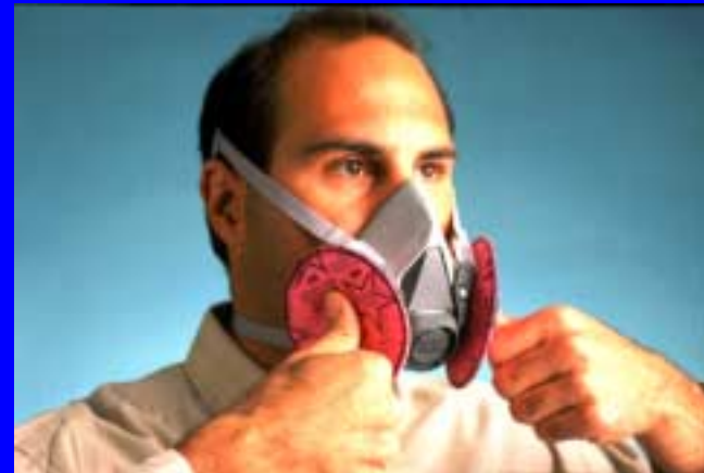
Negative Pressure Check