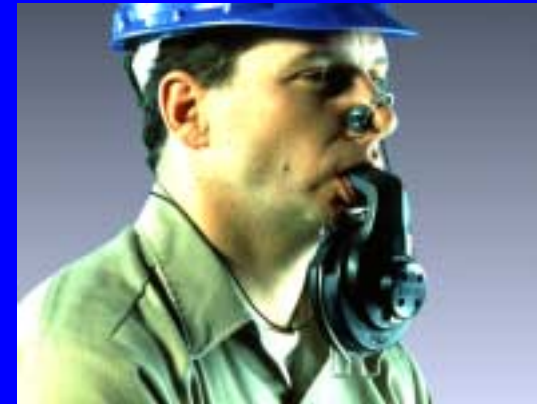
Mouthpiece/Nose Clamp (no fit test required)