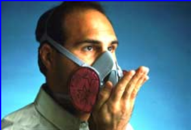
Positive Pressure Check

An action conducted by the respirator user to determine if the respirator is properly seated to the face.