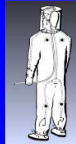
Full Body Suit